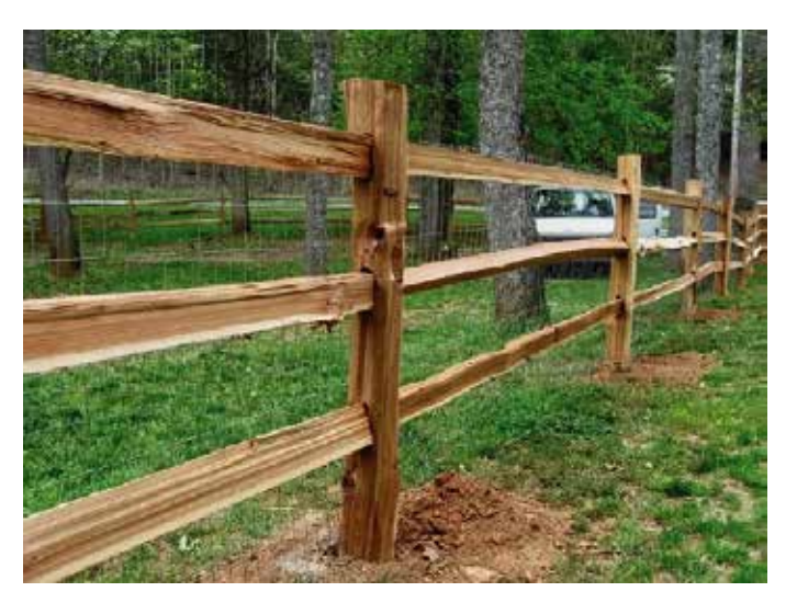
Rustic Cedar Split Rail