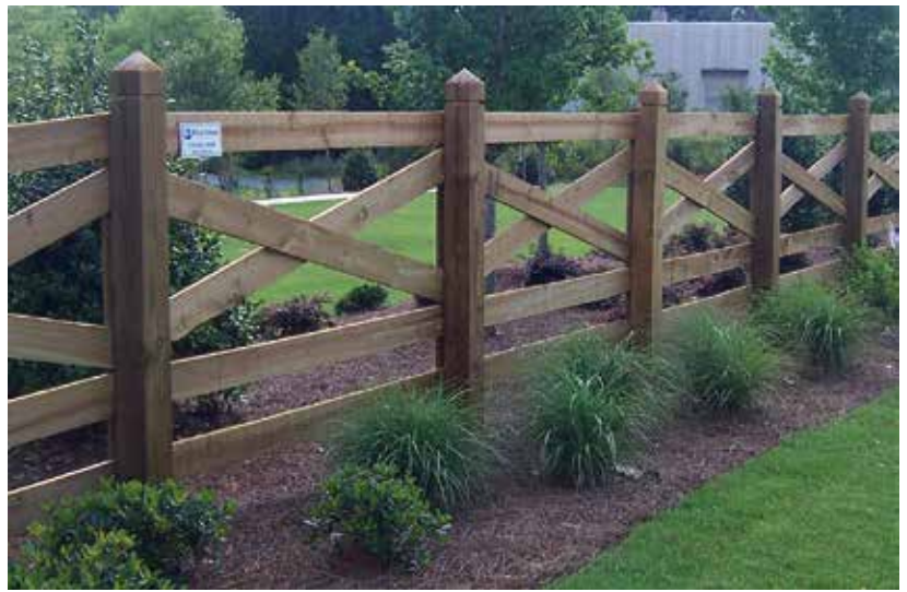
Cedar Crossbuck with Double Bottom Rail